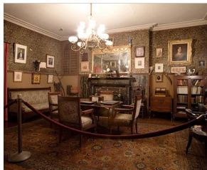
The Booth Room

In 1888, Edwin Booth purchased a mansion in the center of Gramercy Park and had it redesigned by famed architect Stanford White to become the home of The Players. For generations, The Players has brought actors into contact with people of different professions and served as a gathering place for painters, art patrons, journalists, authors, intellectuals, sculptors, architects, and professionals within the business community. In addition to being a home for social interaction, The Players continues to preserve its heritage by remaining a repository of both American and British theater history, memorabilia, and theatrical artifacts. Visitors can view one of the finest collections of theatrical art extant including John Singer Sargent’s great portraits of actors Lawrence Barrett and Joseph Jefferson, second president of The Players. Theatrical memorabilia like rare playbills from the 19th and 20th centuries, the Savonarola chair used by John Barrymore when playing Hamlet and Mark Twain’s pool cue are also on display.