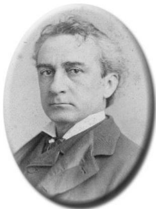
Edwin Booth, founder of The Players.

Its purpose: “The promotion of social intercourse between members of the dramatic profession and the kindred professions of literature, painting, architecture, sculpture and music, law and medicine, and the patrons of the arts...”